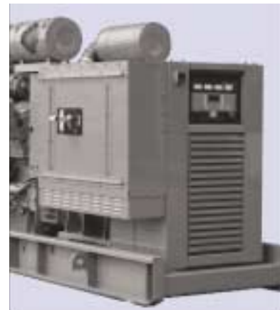
Circuit breaker can be fitted either side of generator set.

These systems include an extensive array of standard control and digital display features that eliminate the need for discrete component devices such as voltage regulator, governor, and protective relays. The PowerCommand® Digital Paralleling Control also eliminates the need for separate paralleling control devices such as synchronizers and load sharing controls.