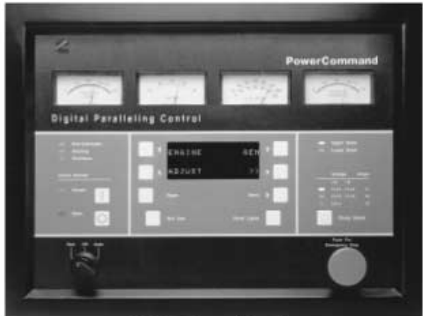
PCC PowerCommand® Control – standard configuration with optional contactor buttons shown